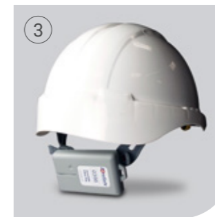
Helmet not included