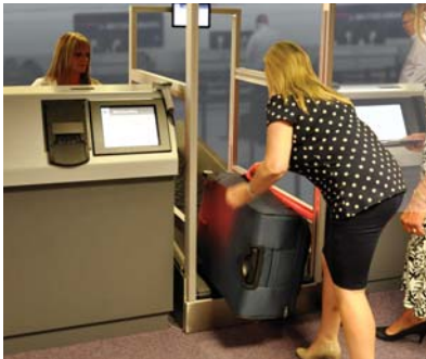
Passenger / Bag Registration