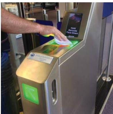
Mach-SmartAccess® Boarding Pass

The Mach-SmartBRS® collects and generates SLS and traffic statistics for integration with AODB billing systems.