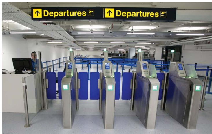
Grouped Boarding Pass Access Gates

Mach-SmartAccess® module design caters for single or multiple access gates to be configured for use at any security access point throughout the airport. Dependent on the access point security level the gates can be manned or unmanned. With Mach-SmartAccess® gates strategically positioned throughout the airport, PAX's access data provides accurate PAX's tracking and statistics for airport/airline SLA's